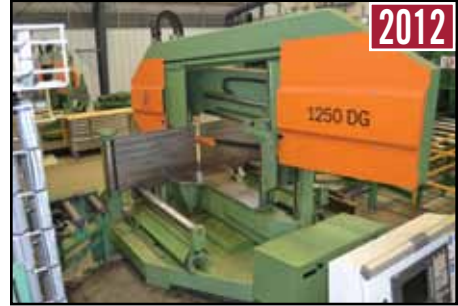
2012 PEDDINGHAUS / MEBA 1250DG Double Miter Horizontal Programmable Band Saw