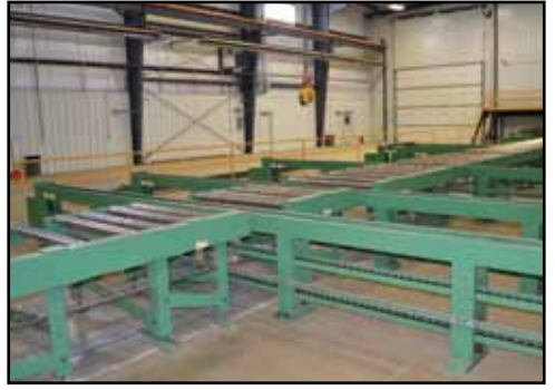
54" x 50' Hydraulic Power Roller Transfer