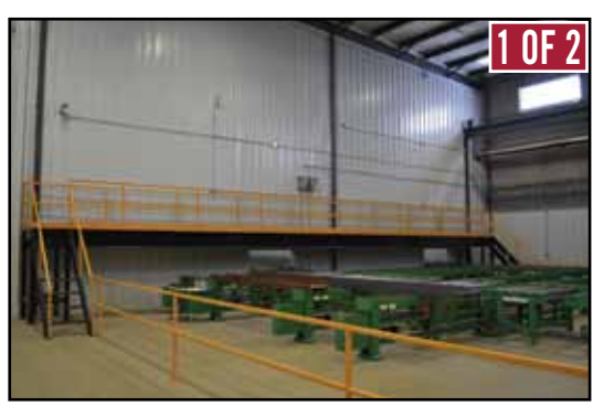
(2) 6' x 60' (est.) Conveyor Crossover Mezzanines