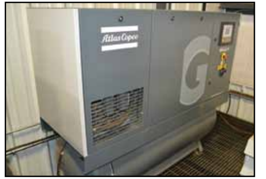
ATLAS COPCO GA22 30-HP Rotary Air Compressor