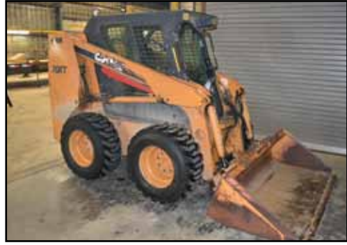
CASE 70XT Diesel Skid Steer Loader