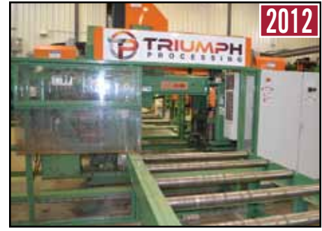
2012 PEDDINGHAUS PCD1100/3C CNC High Speed Beam Drill Line