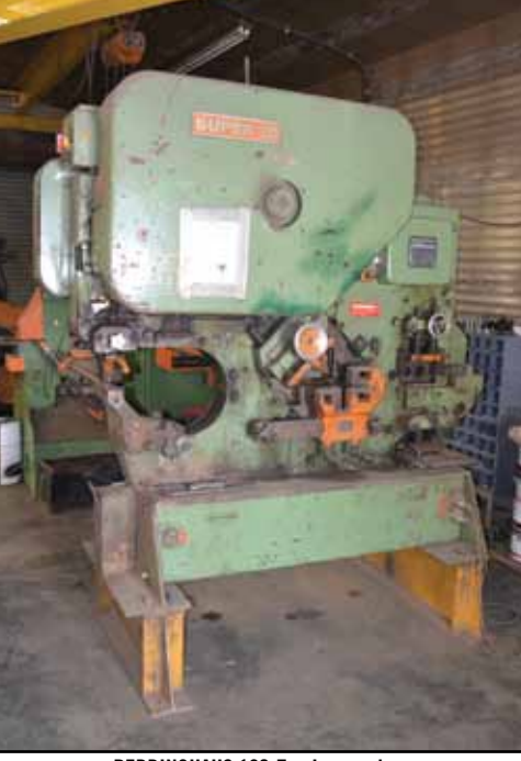
PEDDINGHAUS 120-Ton Ironworker