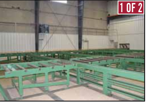
(2) 54" x 120' Hydraulic Power Roller Transfer Conveyors