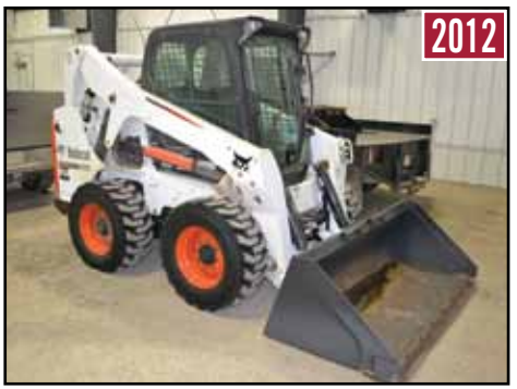
2012 BOBCAT S650 Compact Skid Steer Loader