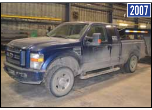
2007 FORD F250 Super Duty XLT Pickup Truck