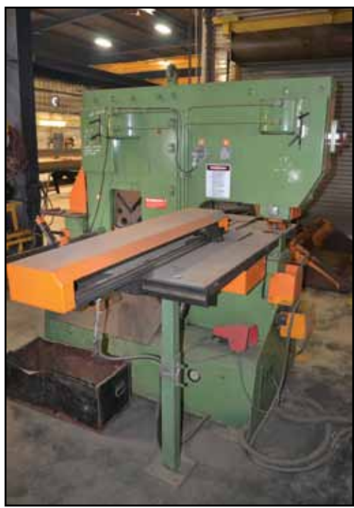
PEDDINGHAUS Peddimax 110-Ton CNC Hydraulic Ironworker