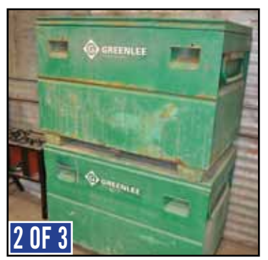
(3) GREENLEE 48" Job Boxes

CASE 70XT Diesel Skid Steer Loader, S/N JAF0371355, 72" Quick Detach Bucket, Enclosed Cab, Late Tires