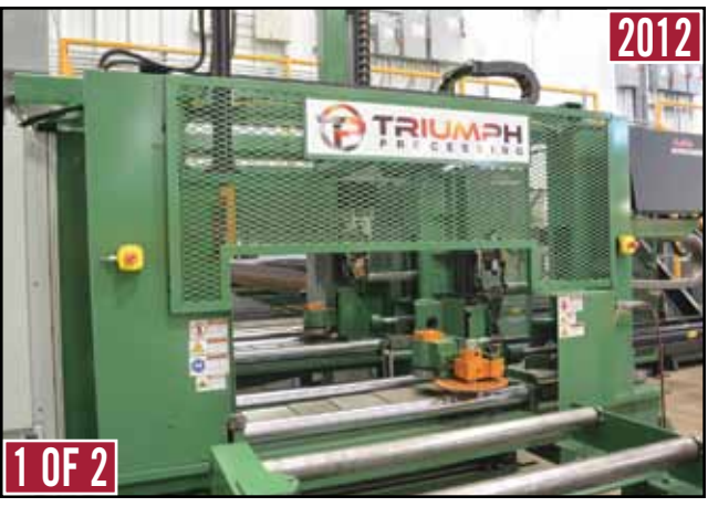
(2) 2012 PEDDINGHAUS Peddiwriter CNC Automatic Layout Marking Machines

Inspection: Day prior to auction from 9AM - 4PM