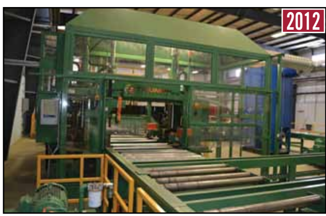
2012 PEDDINGHAUS CNC 4-Axis 3-Torch Burning & Coping System