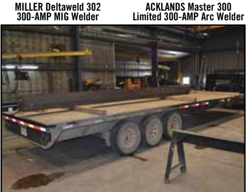
HAY SHED 102" x 30' Wood Deck Tri-Axle Gooseneck Trailer