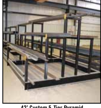
42' Custom 5-Tier Pyramid Steel Storage Rack

Tank-Mounted Rotary Air Compres-sor, Type GA22, S/N AP1464363 ATLAS COPCO 30-HP Horizontal Tank-Mounted Rotary Air Compres-sor, Model GA22FF, S/N AP 1465046 w/A.C. ELEKTRONIKON Graphic Solid State Control 2008 ATLAS COPCO 25-HP