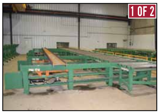
(2) 54" x 65" Power Roller Infeed Conveyors