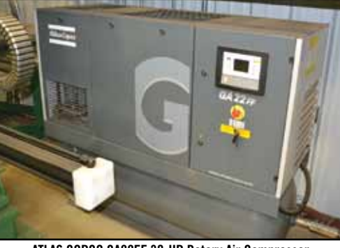
ATLAS COPCO GA22FF 30-HP Rotary Air Compressor

54" x 50' Hydraulic Power Roller Trans-fer w/(5) 30' (est.) Roller Chain Pop-up between Conveyor Glides