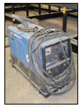
MILLER 300-AMP Trailblazer Portable Gasoline Welder/Generator