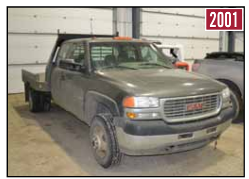
2001 GMC 3500XL S/A Flatbed 5th Wheel Truck